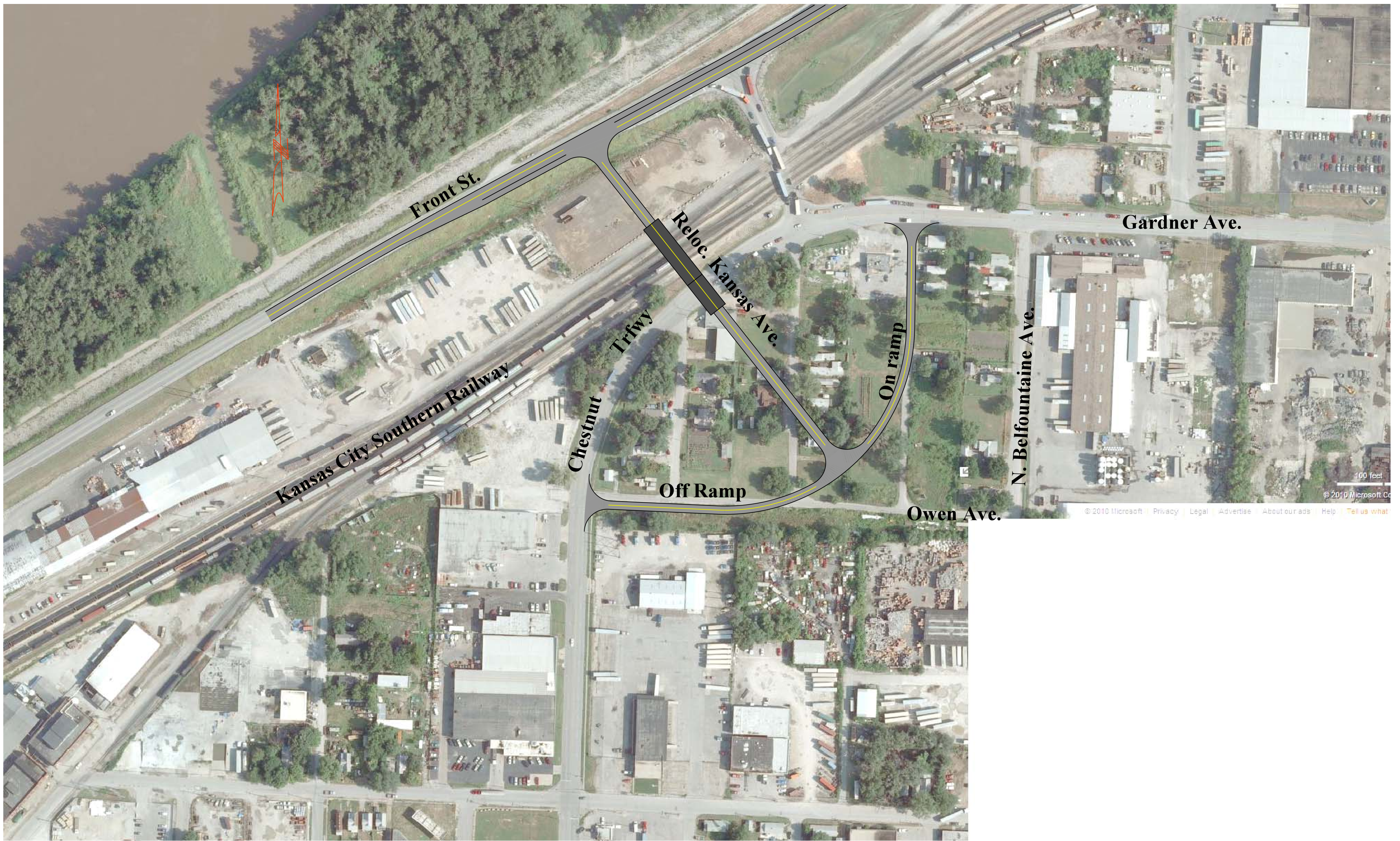
PLAN VIEW (ALTERNATE 2)